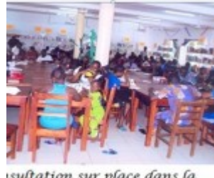
consultation sur place dans la ibliothèque de Porto-Novo I