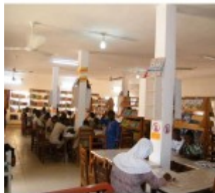
Banque du CAEB à PARAKOU