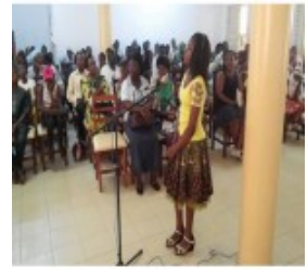
Phase finale du concours Spelling Bee organisé par le Centre de langues du CAEB