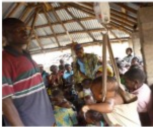
ice de pesée: lecture de la balance par un ibre de comité à Avagbodji