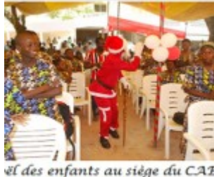
él des enfants au siège du CAE orto-Novo