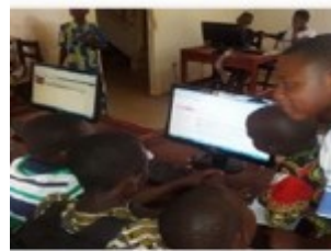
Les internautes en travaux d'exposé dans le cyber du CAEB