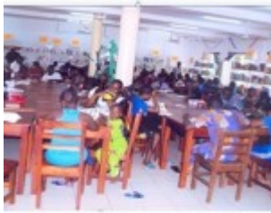
Consultation sur place dans la bibliothèque de Porto-Novo I